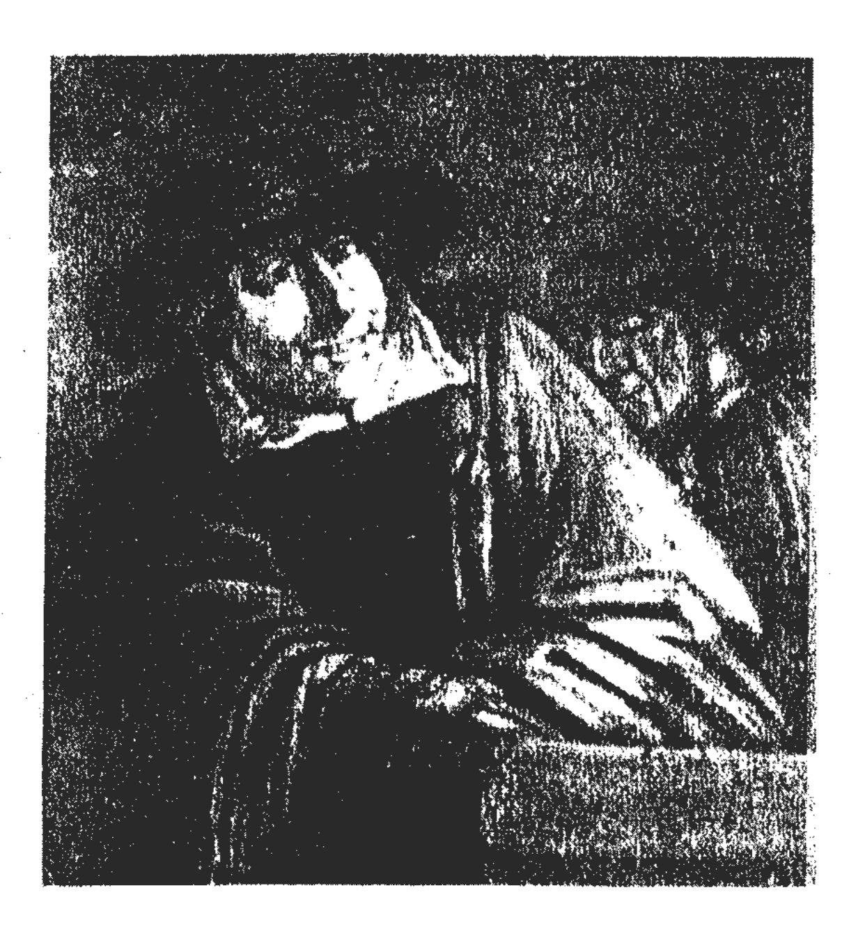
Southern Appalachian Yearly Meeting and Association June 9–12, 1994

Hiwassee College, Madisonville, Tennessee